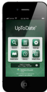
UpToDate App for iPhone and iPad