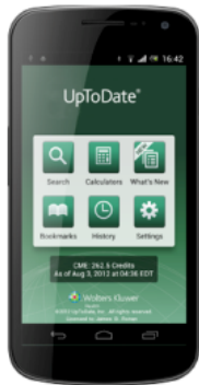
UpToDate for Android™ devices